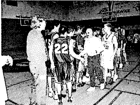
Above: Hawks shake hands with Tok after winning first place.

Boys took first place along with the ladies and will also be heading to Anchorage. Both girls and boys games were very exciting. Galena fans went wild when the Hawks beat Tok on Friday night!!