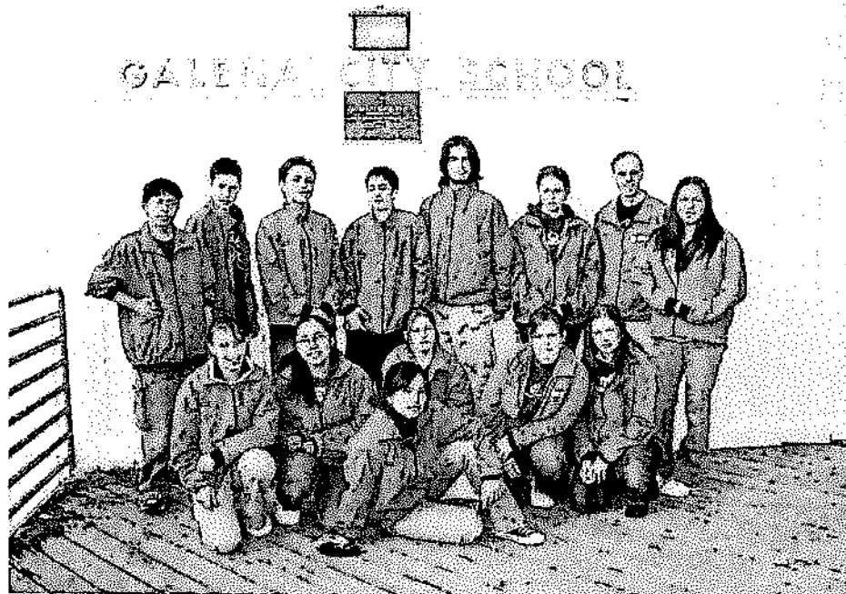
The Galena ski team