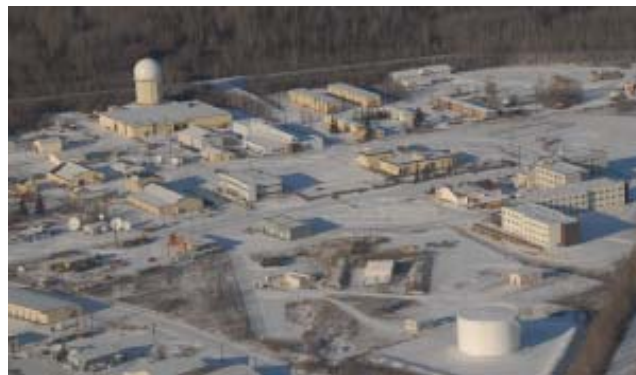
This aerial view of the GILA campus was taken courtesy Noel Frisbie, the school's aviation teacher. Staff photo

The city of Galena asked the GILA journalism class to document the buildings on base now that the city owns the old Air Force base.