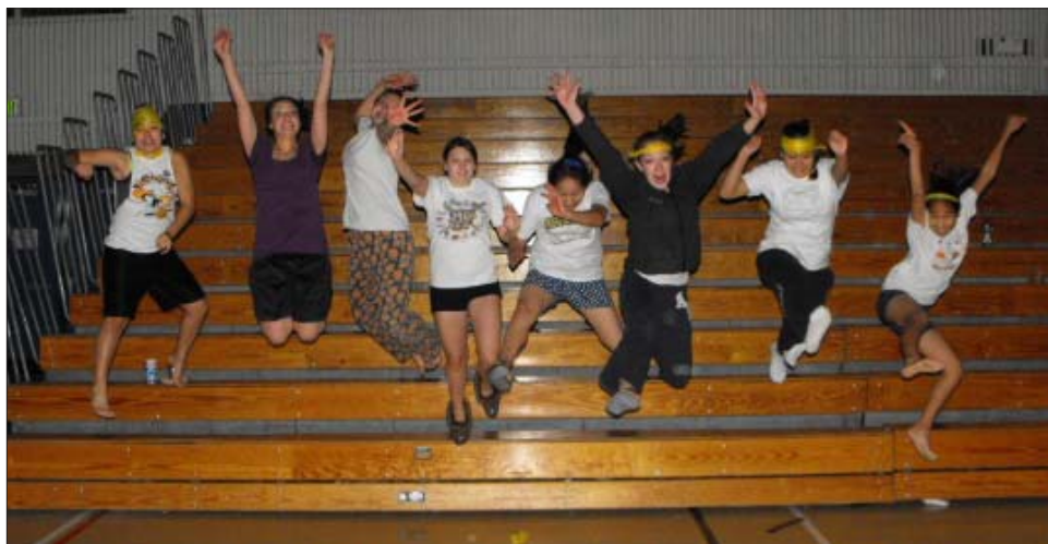
The Galena Hawks volleyball team in Kotzebue this fall.

She looks forward to coaching next year and is excited for the young players coming up.