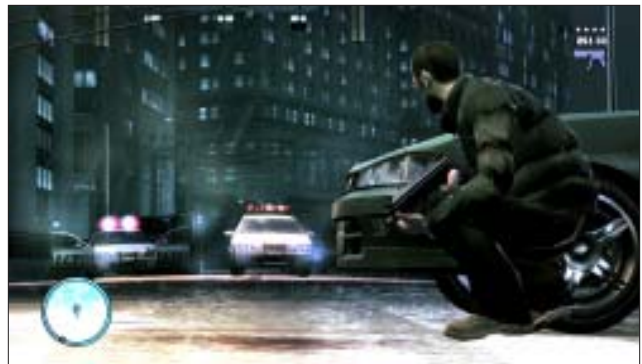
A screen shot from the game Grand Theft Auto IV .

When you shoot up a car, every individual bullet hole is dented into the car, not like the previous GTA games where it is preset to dent the same way every time.